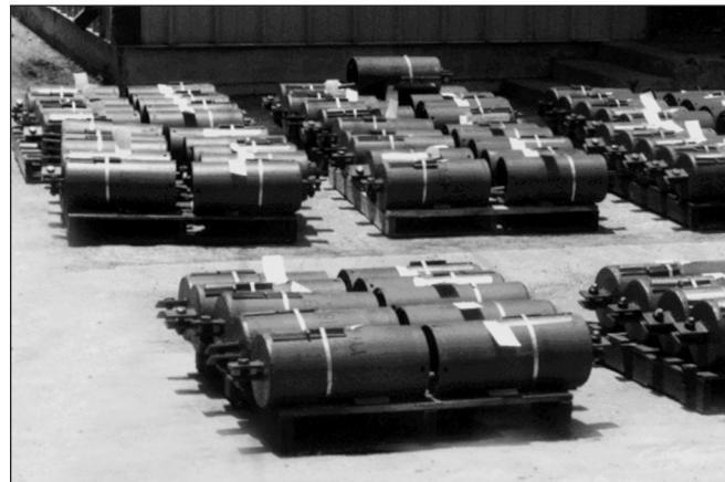
FIG. 400 LIGHT DUTY VARIABLE SPRING HANGERS