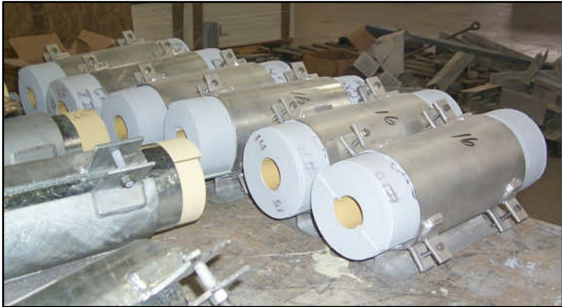
Polyurethane used in the fabrication of Cryogenic Supports