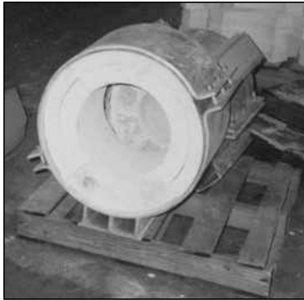
Guided Hotshoe with Center Stop