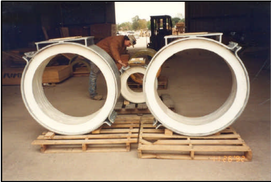
Hotshoes ready for Shipment