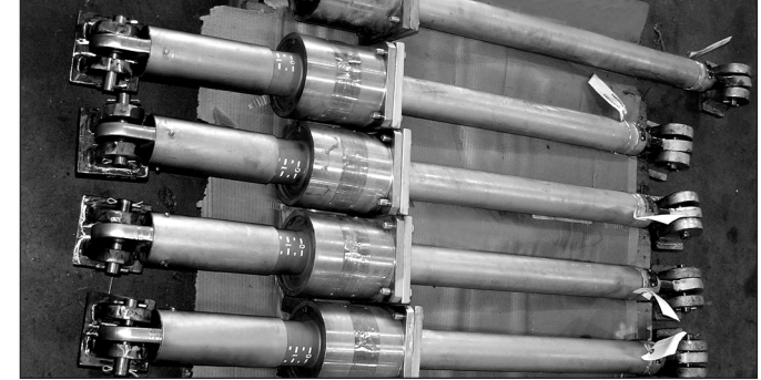
MECHANICAL SNUBBER ASSEMBLIES